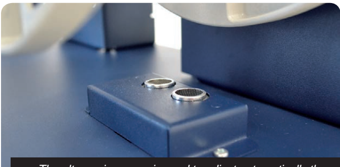
The ultrasonic sensor is used to adjust automatically the tension on the media despite the roll diameter variation.

The unit is equipped with an electronic clutch system that allows the user to set manually the main media tension depending on pre die-cut label's path complexity and type of media.