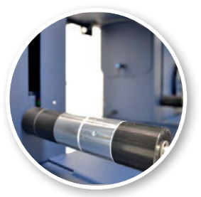
Ultrasonic tension arm