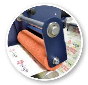
Sponge pressing roll