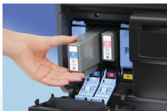
Simple ink cartridge replacement

* Specifications subject to change without notice *1 Edge to edge available