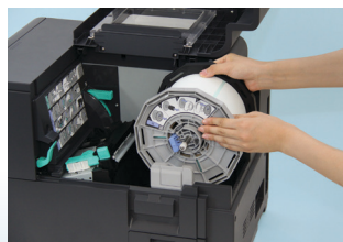
Easy label roll replacement